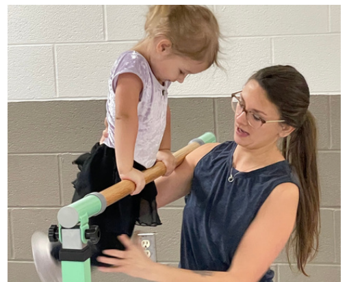
Please visit www.laporteparkandrec.com for more details & class updates.